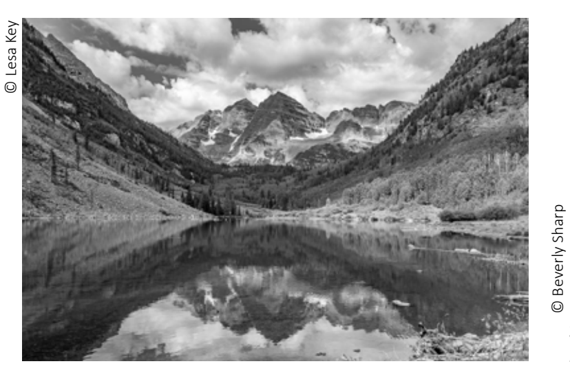
2nd Place Maroon Bells Reflection Lesa Key