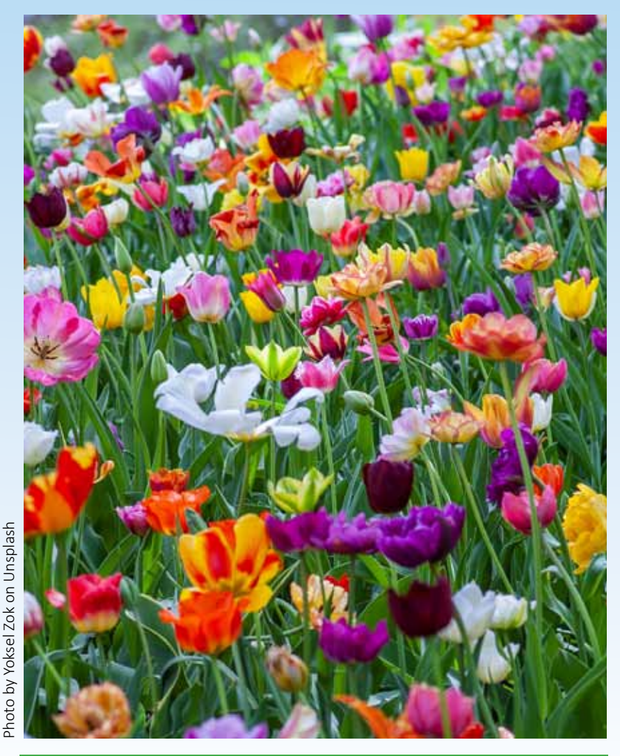
Remember to vote for the People's Choice awards for March!

It's Springtime... Get out and enjoy taking some new photos!