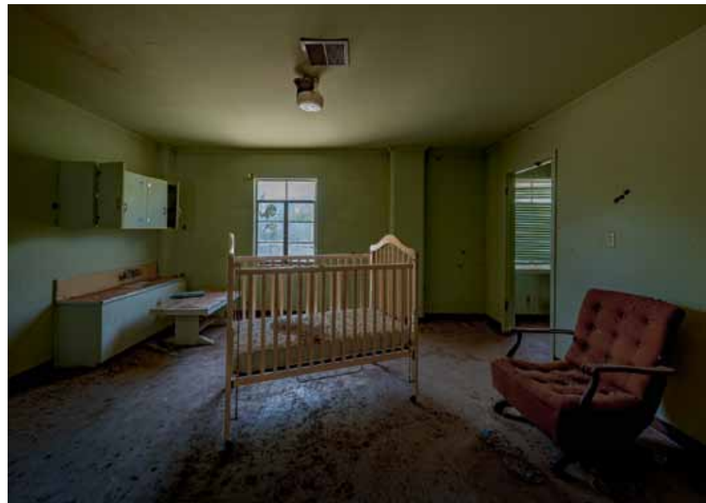
The Nursery