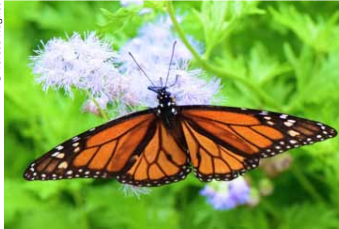
2nd Place Spring Beauty Teresa Hughes