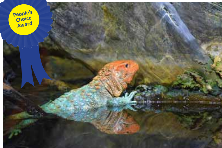
3rd Place & People’s Choice Miniature Monster Monte Zillinger