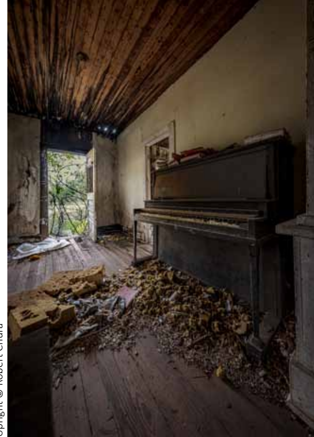
Upright