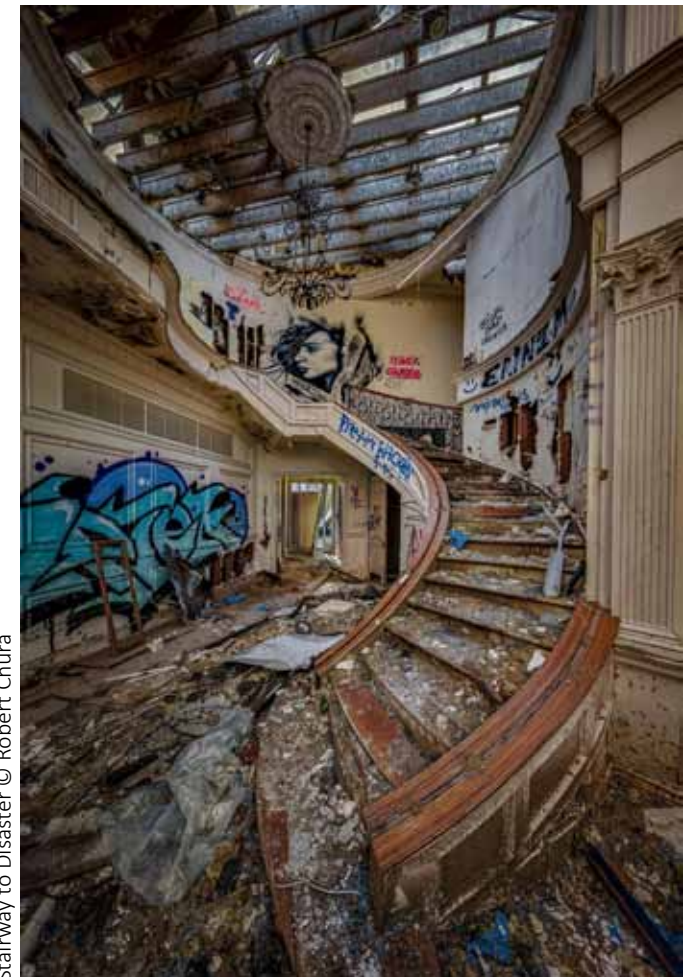
Stairway to Disaster

Find more at his website: robertchura.com