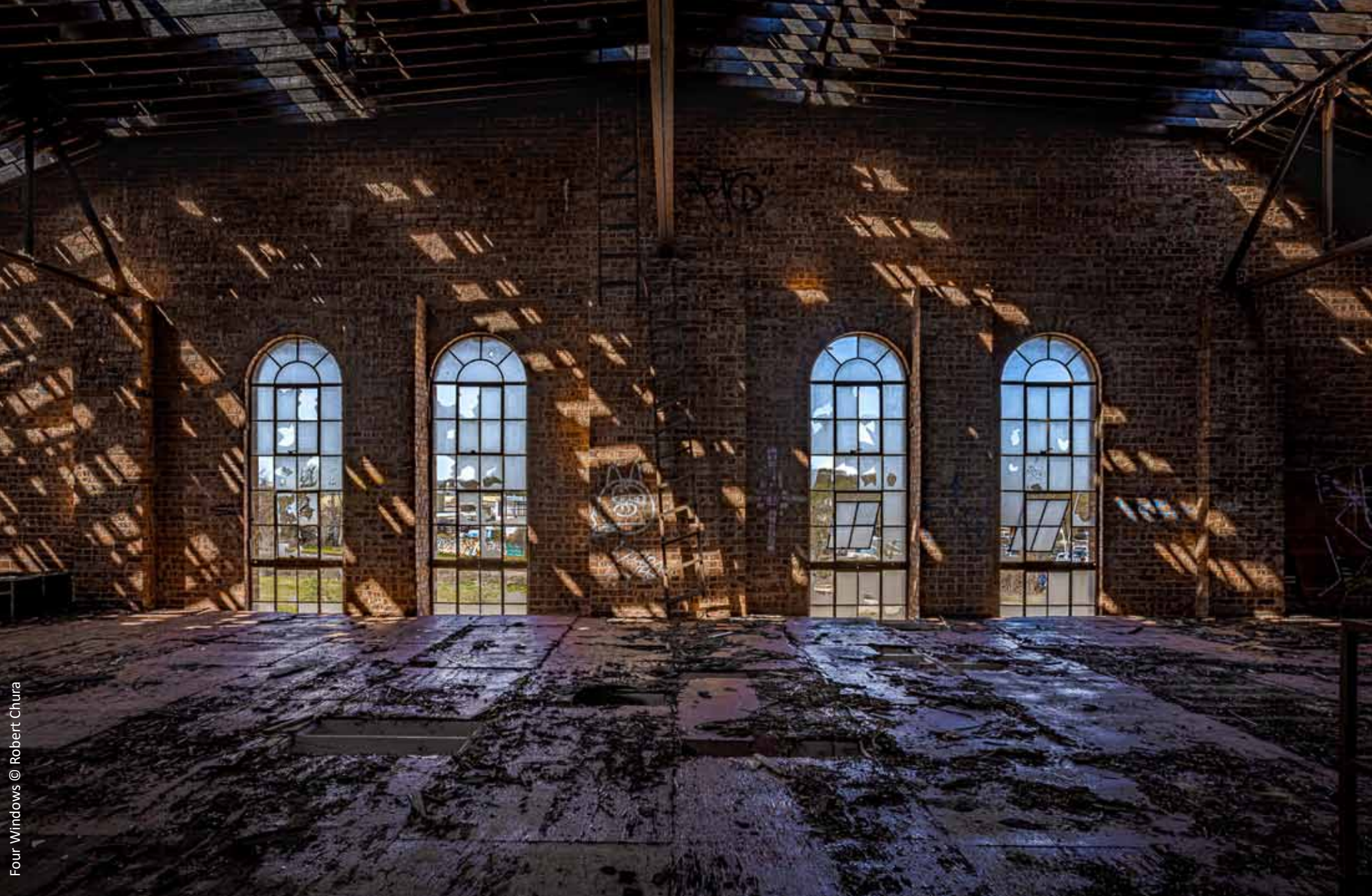
Four Windows © Robert Chura