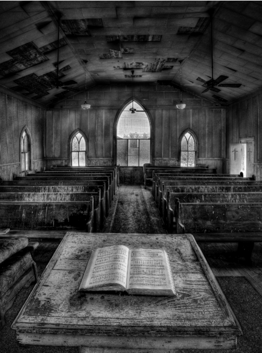
The Pulpit