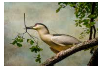
June (tie) Black Crowned Night Heron ala Audubon