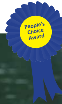
Honorable Mention Early Light - Still Sleeping Bill Webb