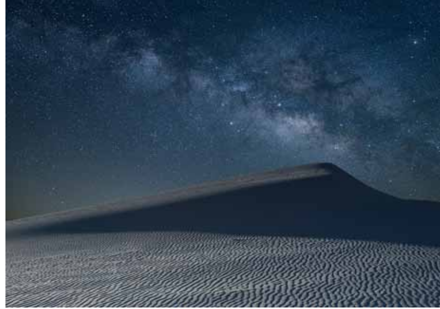
Blue Sands © Lynn Cromer