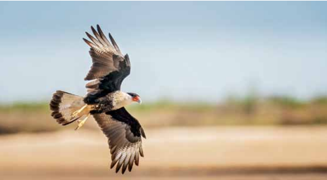
Caracara in Flight at Beach