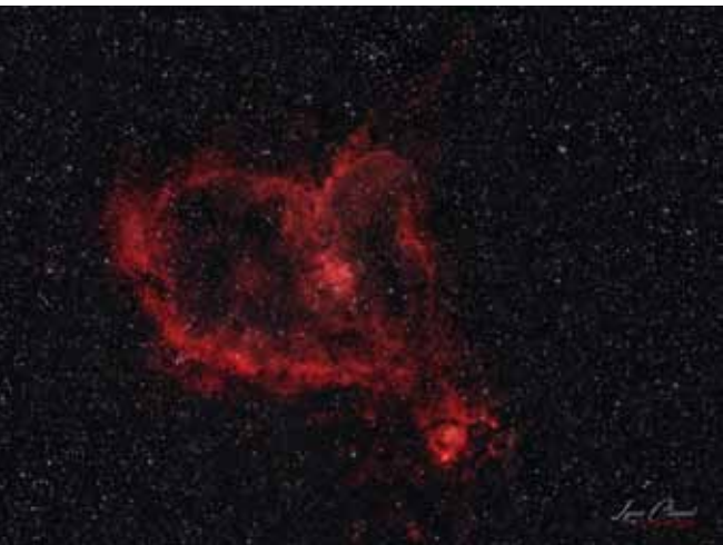
Heart Nebula