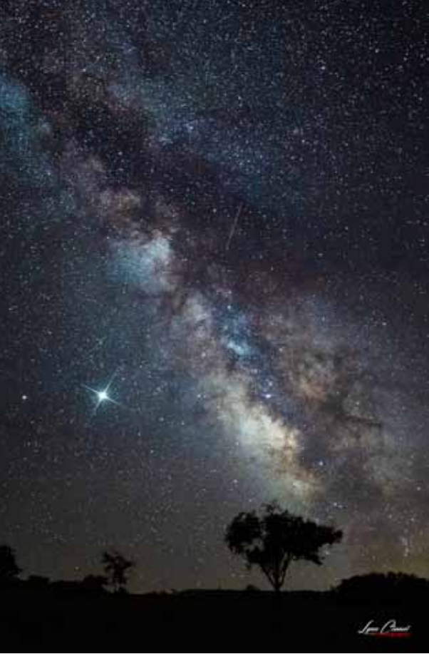
Ft. Griffin