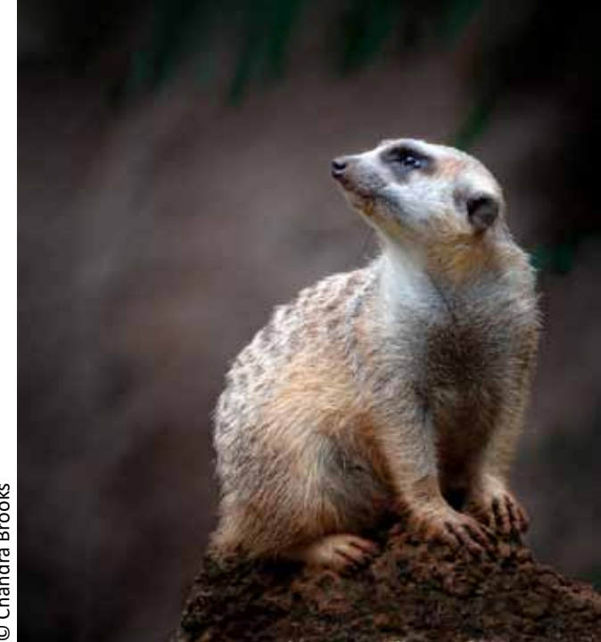
Super Model Pose