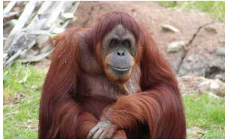
3rd Place Deep Thought Parker Standish