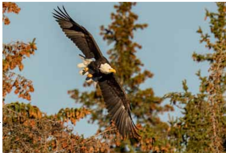
Honorable Mention Flying Free Lesa Key