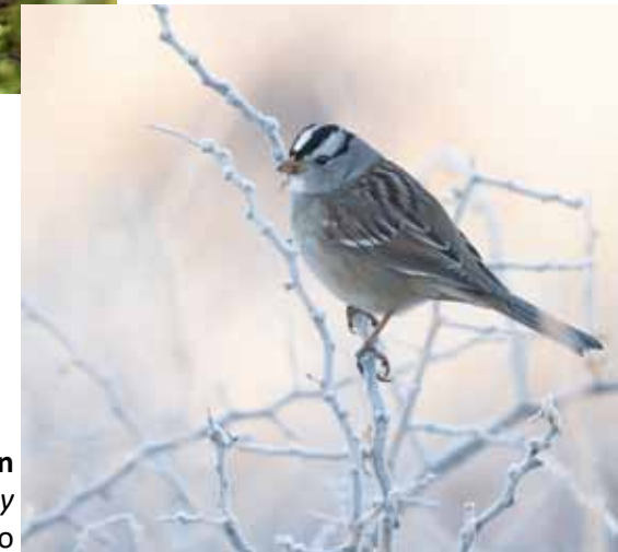
Honorable Mention White Crowned Sparrow Beauty Lana Macko