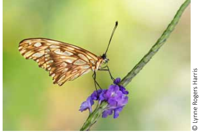
2nd Place Beautiful and Delicate Lynne Rogers Harris