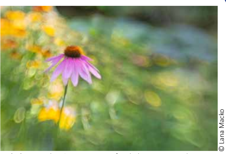
3rd Place Floating on a Sea of Bokeh Lana Macko