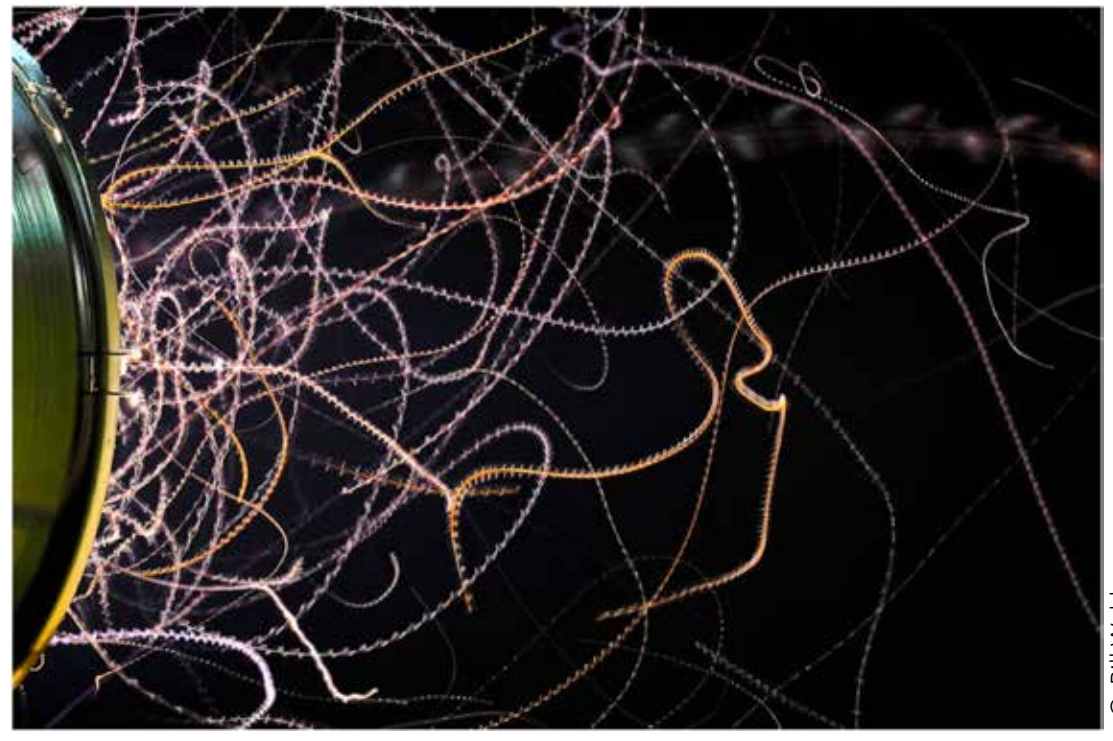
Worth a (Two) Second Look Bill Webb

Have a good shot with a great story? Send it in to The Shutterbug.