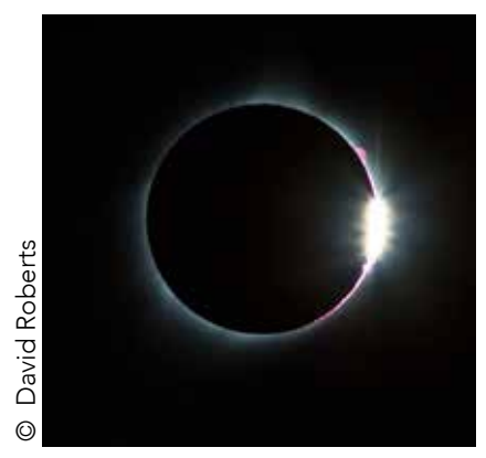
The Shutterbug | June 2018 | 6