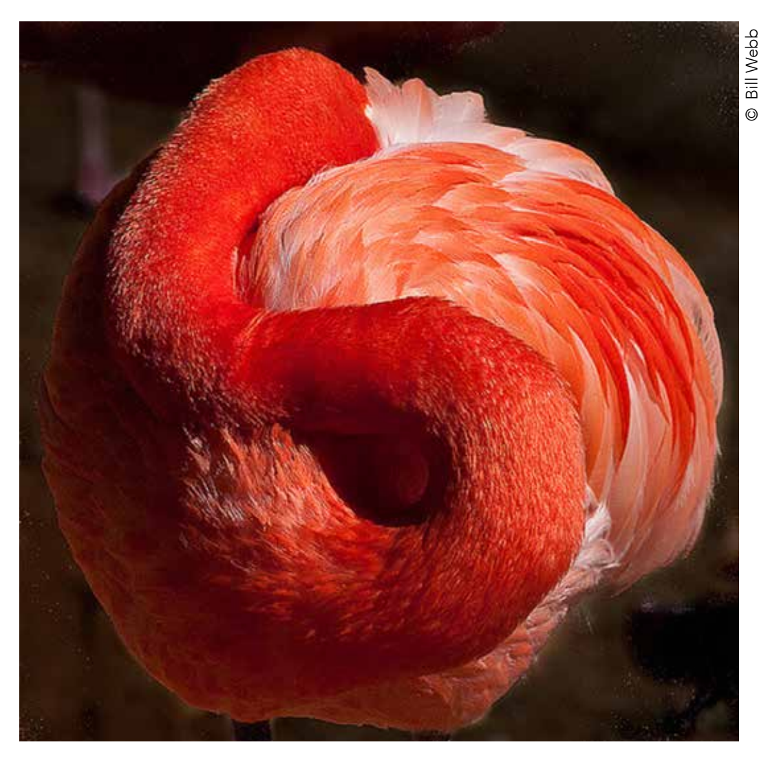
Flaming S not FlamingO Bill Webb