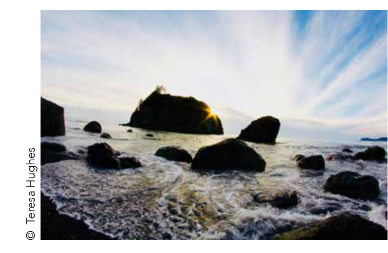
3rd Place Sunset on the beach Teresa Hughes