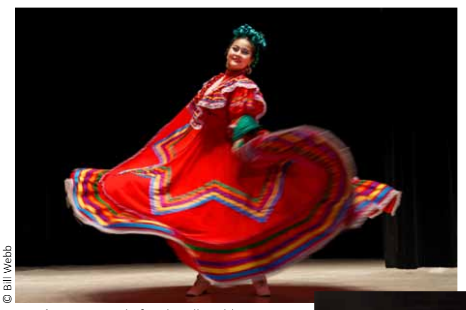
1st Place A Swirl of Red Bill Webb

"During a celebration of Mexican Independence where Ballet Folklorico of Fort Worth was performing, I captured the beauty and energy of the dancers and their swirling dresses. I used a slow enough shutter speed to allow the dress to blur while keeping the dancer's face sharp as she was turning, a wide aperture to gather as much light as possible, and a low ISO to minimize noise in the image. Post-processing cleaned up some distracting scuff marks on the stage floor." (1/60 sec., f/4, ISO 100, ambient light)