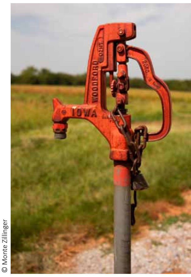
Pump Handle Monte Zillinger 1st Place

"Linda and I were randomly looking for something red to photograph. While photographing something else I noticed the red pump handle along the edge of a field. I decided to just fill the frame with the pump handle and let the background blur out. I took the photo in aperture priority. In processing I used Photoshop Elements to boost color saturation and then used Topaz to improve the clarity. (Nikon D750 ISO 200 1/2500 f/4.5).