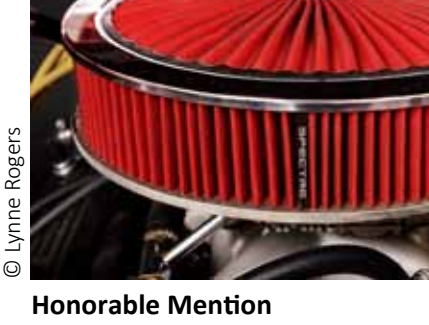
Spectre Clean Lynne Rogers