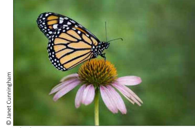
4th Place Beautiful to Look at, but Hard to Catch Janet Cunningham The Shutterbug | November 2021 | 6