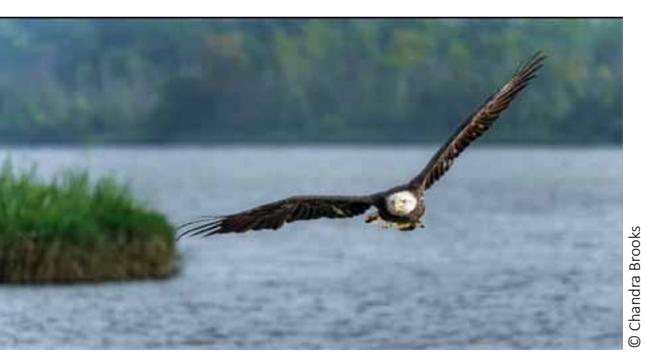
1st Place Morning Flight Chandra Brooks

"Taken in August from a boat on the James River in Virginia, the sight of these majestic birds, with their long wingspans, is truly special. I always enjoy the challenge of capturing them in flight with good focus, good light and good wing position."