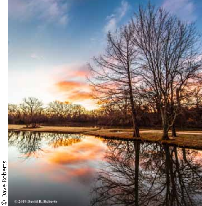
Daybreak at Mill Pond - CNC

You can check out my work at: davidBroberts.smugmug.com