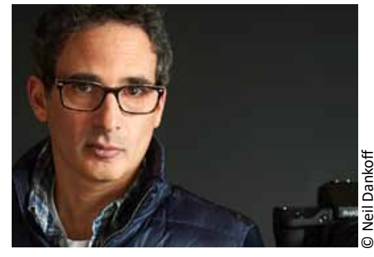
November In-Person & Virtual Zoom Meeting Monday, November 22, 7:00 pm (CST)