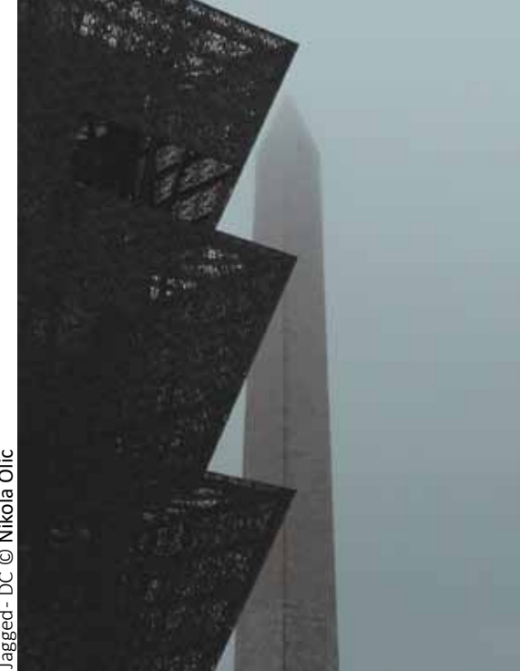
Jagged - DC