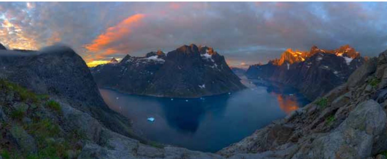
High Camp in Greenland