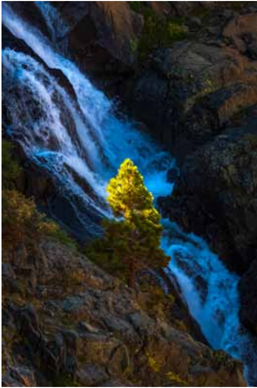
Lit Tree

This presentation will help you to look at your work where you are in different ways than ever before. It will help you to define a little bit of where you are and where you might want to go.