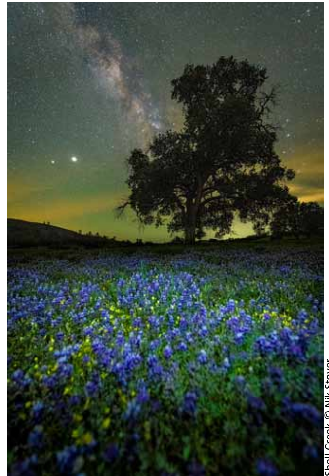
Shell Creek