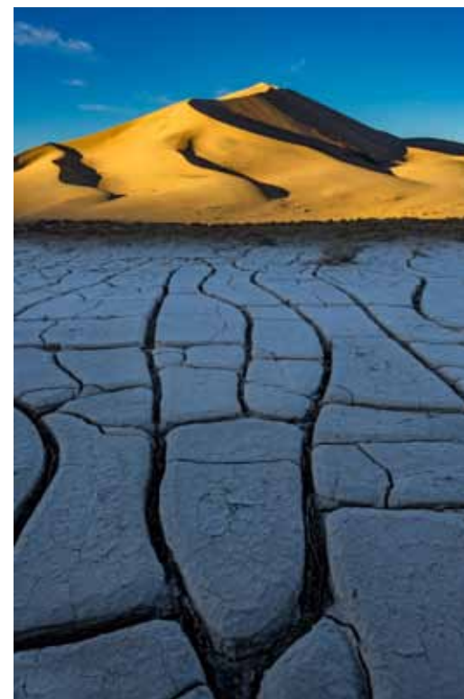
Focal Length - Blended Dunes

His landscape photography work has taken him all over the globe from the back country of Greenland to the windswept mountains of Patagonia to the frigid extremes of Alaska. His portfolio of work encompasses aerial photography, desert, ocean, night, and mountain photography.