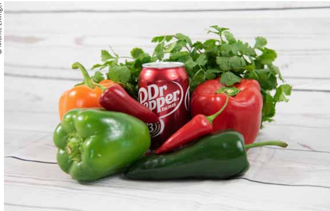
2nd Place Peck of Peppers Monte Zillinger